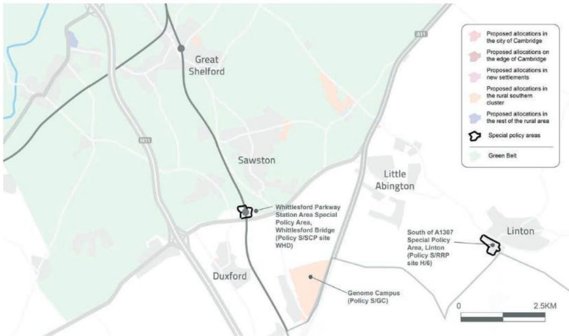
Figure 36: Map showing locations of proposed village allocations in the rural southern cluster

It is proposed that 40% of the homes built (on sites which provide 10 homes or more), should be for social rent, affordable rent, shared ownership, or discounted market sales - which are now the various government definitions of ‘affordable housing’.